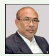
Sh. Nongthombam Biren Singh Chief Minister Manipur