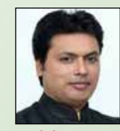
Sh. Biplab Kumar Deb Chief Minister Tripura