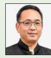
Sh. Prem Singh Tamang Chief Minister Sikkim