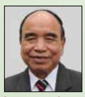
Sh. Zoramthanga Chief Minister Arunachal Pradesh