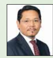
Sh. Conrad Sangma Chief Minister Meghalaya