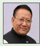
Sh. T.R. Zeliang Chief Minister Nagaland