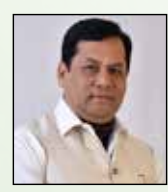
Sh. Sarbananda Sonowal Chief Minister Assam