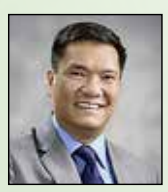
Sh. Pema Khandu Chief Minister Arunachal Pradesh

26 th to 29 th November 2020 Maniram Dewan Trade Centre, Guwahati