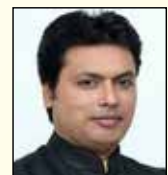
Sh. Biplab Kumar Deb Chief Minister Tripura