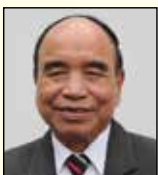
Sh. Zoramthanga Chief Minister Mizoram