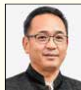
Sh. Prem Singh Tamang Chief Minister Sikkim