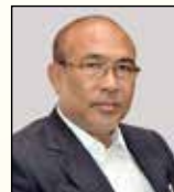
Sh. Nongthombam Biren Singh Chief Minister Manipur