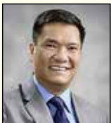
Sh. Pema Khandu Chief Minister Arunachal Pradesh