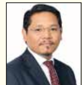
Sh. Conrad Sangma Chief Minister Meghalaya