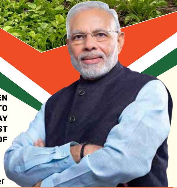
Sh. Narendra Modi Hon'ble Prime Minister

“ THERE WERE TIMES WHEN PEOPLE WERE SCARED TO COME TO NORTHEAST. TODAY THE REGION IS ON THE LIST OF NEXT DESTINATION OF TOURIST ”