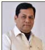
Sh. Sarbananda Sonowal Chief Minister Assam