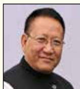
Sh. T.R. Zeliang Chief Minister Nagaland