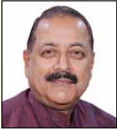
Dr. Jitendra Singh

Minister of State (Independent Charge) for the Ministry of Development of North Eastern Region and Minister of State for Prime Minister's Office; Personnel, Public Grievances and Pensions; Department of Atomic Energy and Department of Space