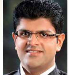
Shri Dushyant Chautala Deputy Chief Minister of Haryana